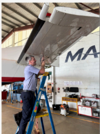
Working in the hanger

For our family, the days weren't always easy—balancing the kids and our studies was a challenge—but watching our children gradually play and interact with the local PNG kids in the compound made every bit of effort worth it.