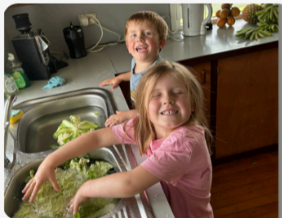
Helping wash the market veg

Look below if you want our video update!