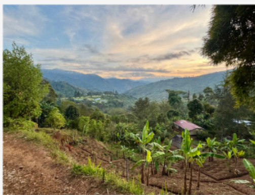
Looking down on Kompiam